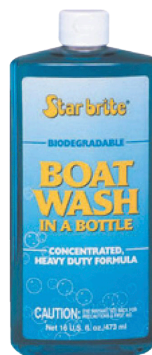
Boat Wash in a Bottle